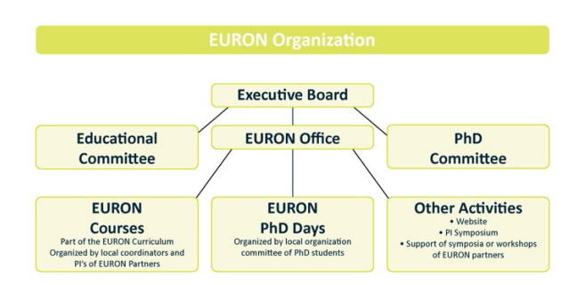
Figure 1: Organizational structure of EURON

During the latest agreement period (2017-2020), EURON comprised eight partner universities in Belgium, France, Germany, Luxembourg and the Netherlands, with Maastricht University being the Lead Partner and coordinator of EURON (Annex 1). The EURON coordinating office is the School for Mental Health and Neuroscience (MHeNs) of the Faculty of Health, Medicine and Life Sciences. The organizational structure of EURON, which was installed during this agreement period, is depicted in Figure 1.